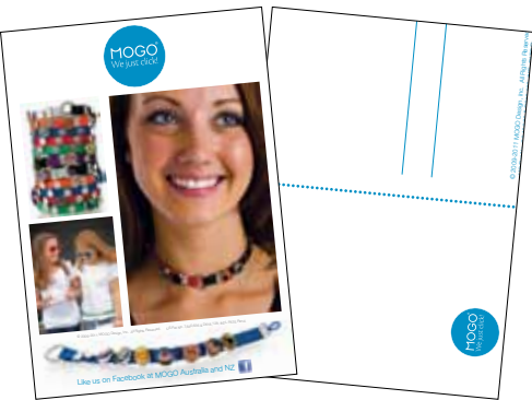
MOGO Post Card