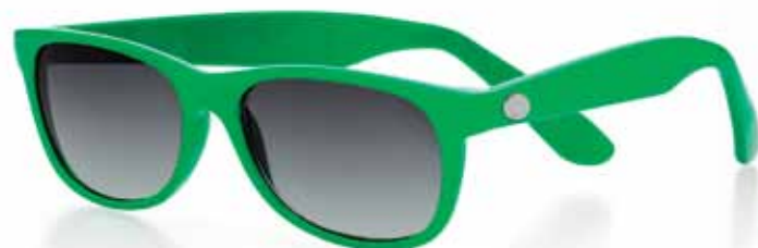
Green • SUN12-GRE

MOGO Neon Shades are the perfect tween accessory featuring retro styling and hot neon colours. Each pair of sunglasses will hold 2 MOGO Charms – ready for instant personalisation (Charms sold separately). Shades are UV400 and comply with the Australian and New Zealand standards AS/NZS 1067.