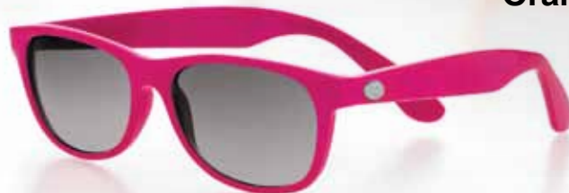
Pink • SUN12-PIN