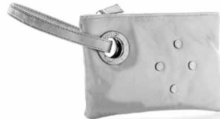
Silver Izza • BAG12-WSI

Available in 2 colours: Soft Silver and Neon Pink. Each Izza holds up to 4 Charms (Charms sold separately). Perfect for mobile phones, ID cards and cashola! Size: 15.9cm x 10.2cm