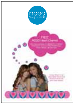
Heart Flower Card