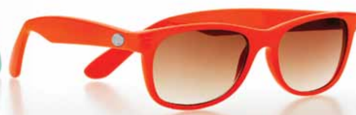
Orange • SUN12-ORA