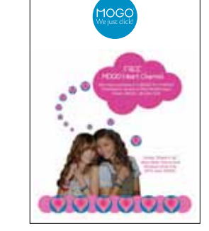
MOGO Post Card