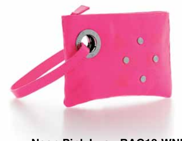
Neon Pink Izza · BAG12-WNP