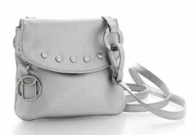
Silver Stella · BAG12-PSI